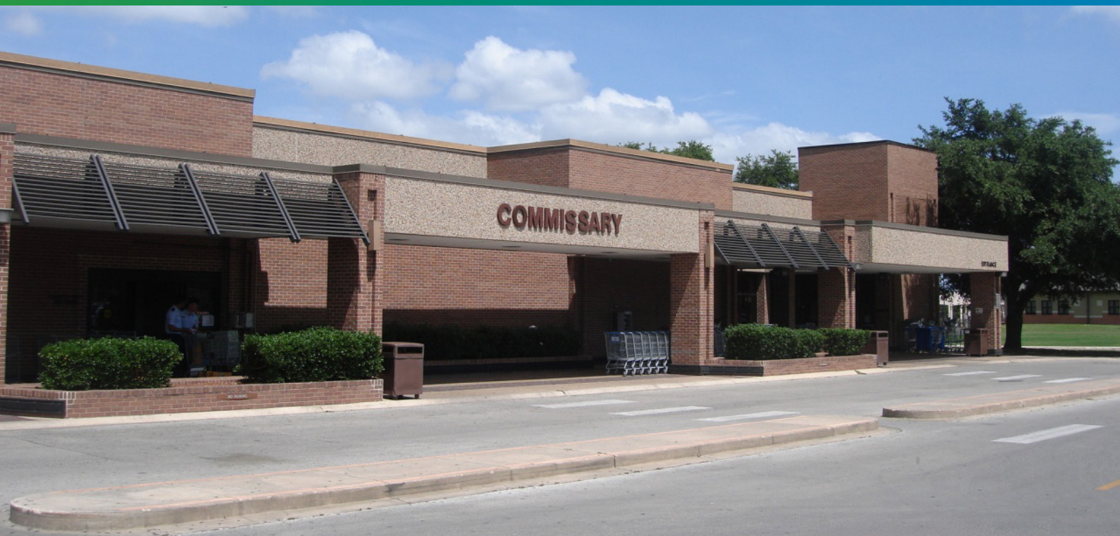
Outside the Lackland commissary.